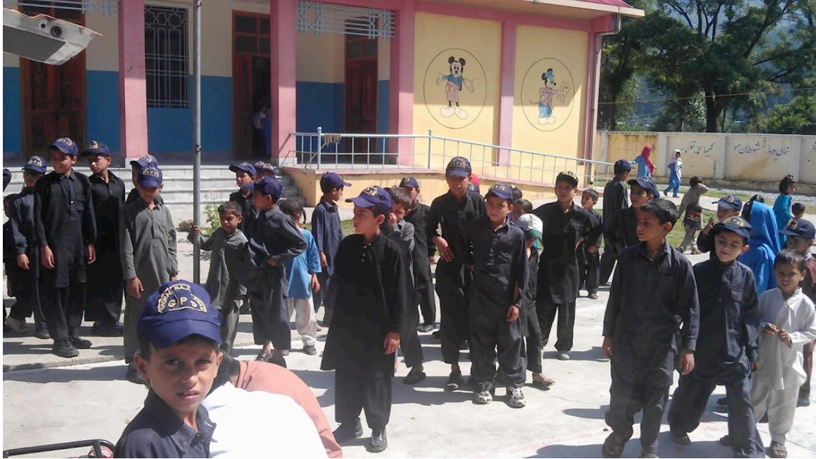
Figure 1. The Public School chosen for this study