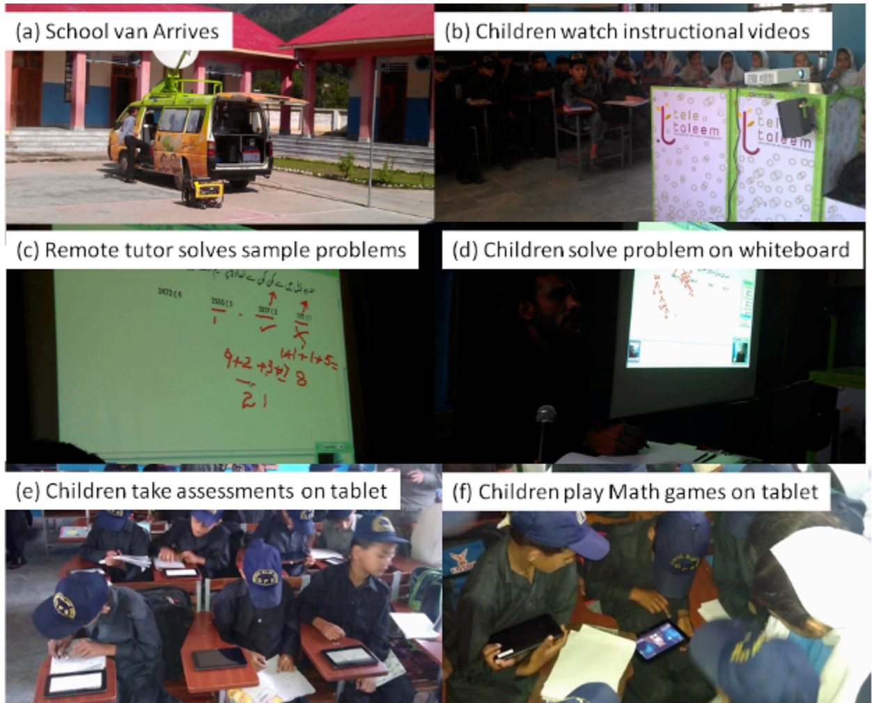
Figure 3. . The learning van visit day activities

The learning van is designed to visit a school once every two weeks for a whole day and the pedagogy can be divided into three stages, pre-visit, during and post-visit. One week before the van arrives, based on the pace of each teacher, the local in-class teacher based in the school is asked to teach students a set of topics and SLOs before the van arrives. A customized online course including the SLOs and related assessments is created for each school for the day of the van visit.