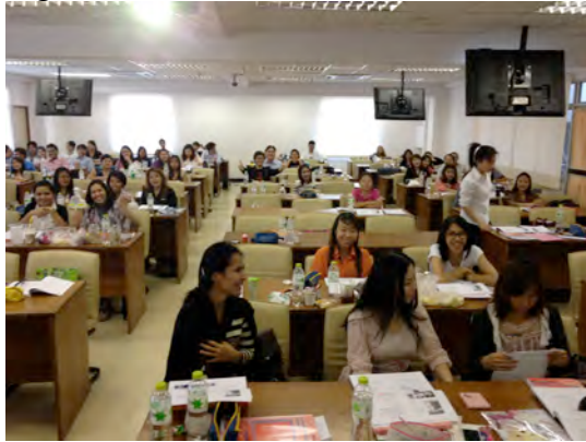
Figure 1 The author visited classes in the regional campuses