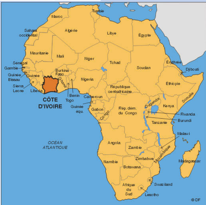
MAP OF IVORY COAT